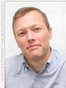
JOHN D. & CATHERINE T. MACARTHUR FOUNDATION

Evicted: Poverty and Profit in the American City by Matthew Desmond (PhD '10) won the 2017 Pulitzer Prize for General Nonfiction and the 2016 National Book Critics Circle Award, and was named one of the best books of 2016 by The New York Times . It also was selected as the 2016 Go Big Read book for UW's common-reading program promoting campus dialogue on social justice. The Pulitzer Prize citation reads, "For a