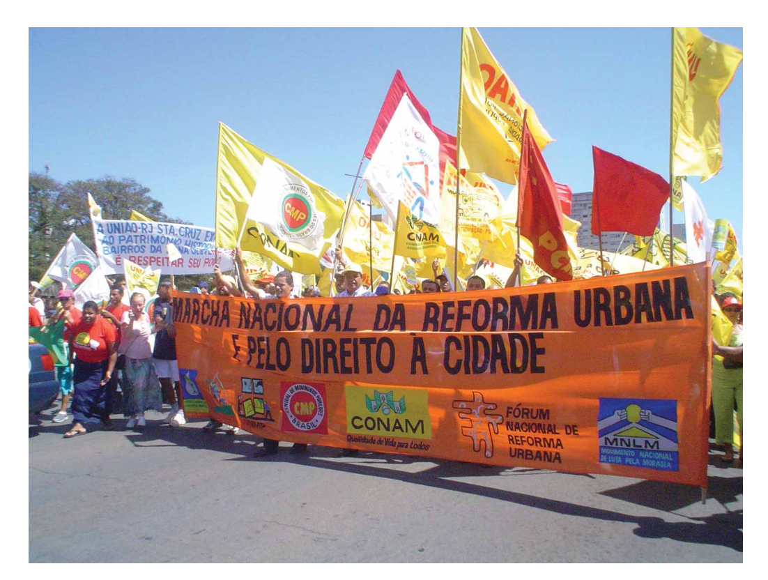
Figure 1 Banner and demonstrators from CMP ( Central dos Movimentos Populares ) and Brazilian urban movements at the National March for Urban Reform and for the Right to the City, Brasilia, September 2005