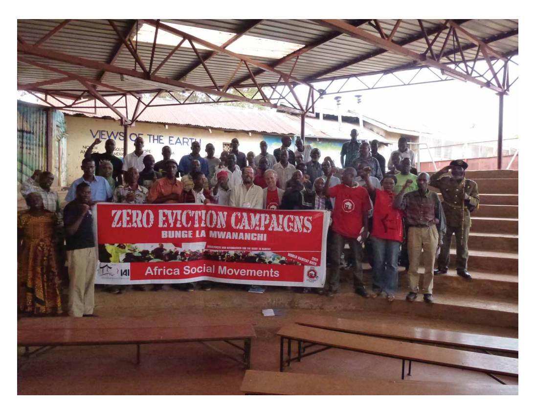
Figure 3 Launch of zero eviction campaign in September 2011, Korogocho , Nairobi

of IAI, echoes others' positions as well, and is probably a central line of divide that results from interviews and direct observations. According to the movements, who should voice and decide on people's positions should be the people themselves, and not professionals or technicians from NGOs.