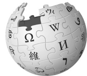
WIKIPEDIA The Free Encyclopedia

This autumn the ASA is launching a Sociology in Wikipedia Initiative. This project has two main purposes: first, to improve the sociology entries in Wikipedia by making it easier for sociologists to become involved in writing and editing them, and second, to facilitate professors giving Wikipedia-writing assignments to students in their courses. Before I explain in more detail how the ASA initiative will advance these goals, let me say a little about Wikipedia.