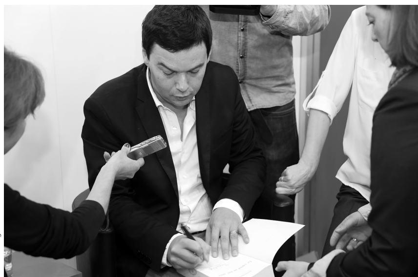
Author Thomas Piketty signing autographs in a scene uncommon to 700-page nonfiction books.

market economy, then, is the division of the national income into the portion that goes to owners of capital and the portion that goes to sellers of labor.