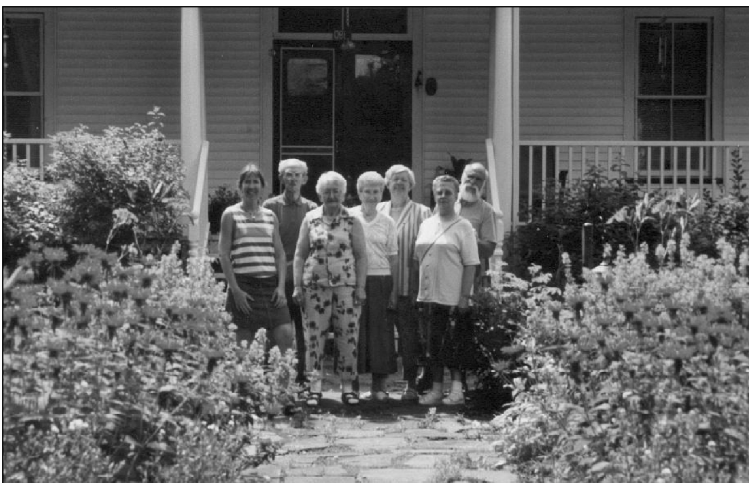
The co-ordinator and several resi- dents in front of La Corvée