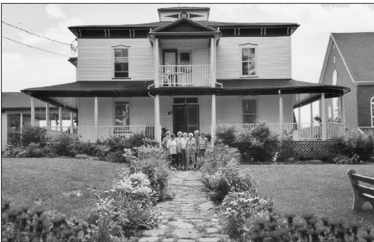
The co-ordinator of La Corvée with several residents