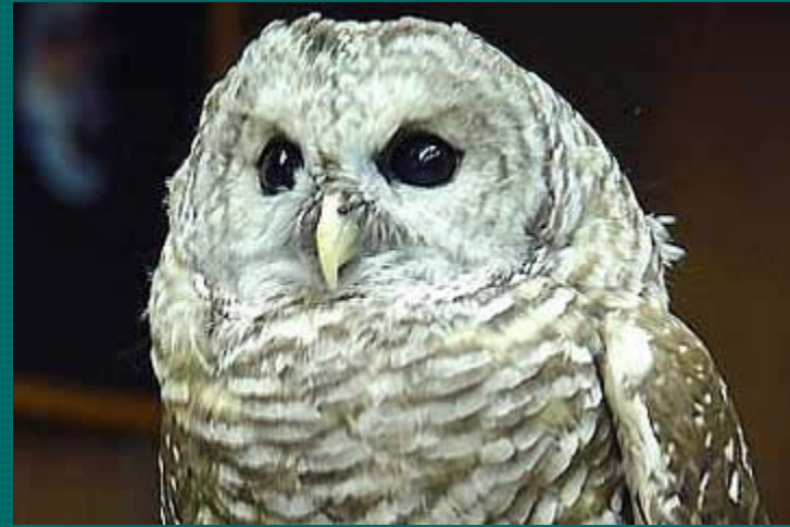
Stella is our Barred Owl