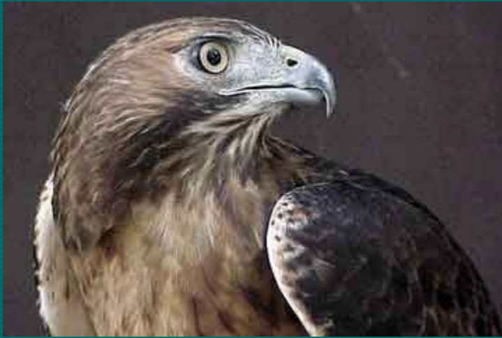
Beauty is our Red-Tailed Hawk